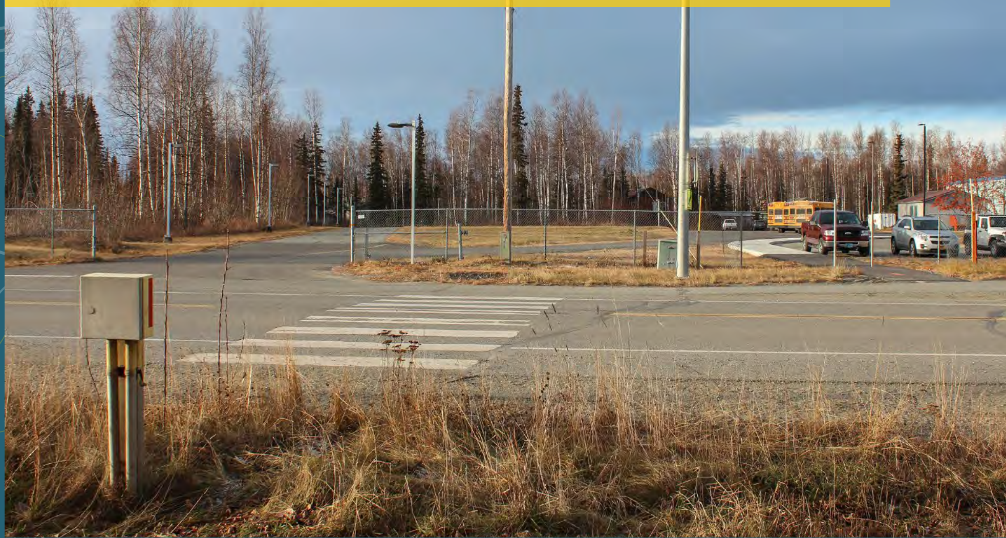
CROSSWALK TO NON-EXISTANT PATHWAY