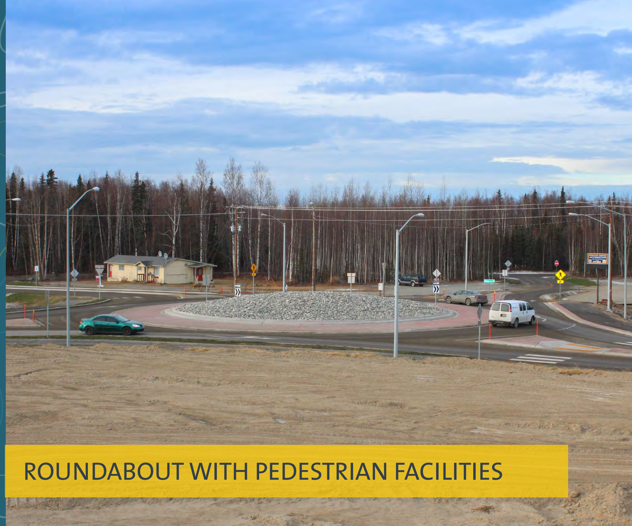
ROUNDBABOUT WITH PEDESTRIAN FACILITIES