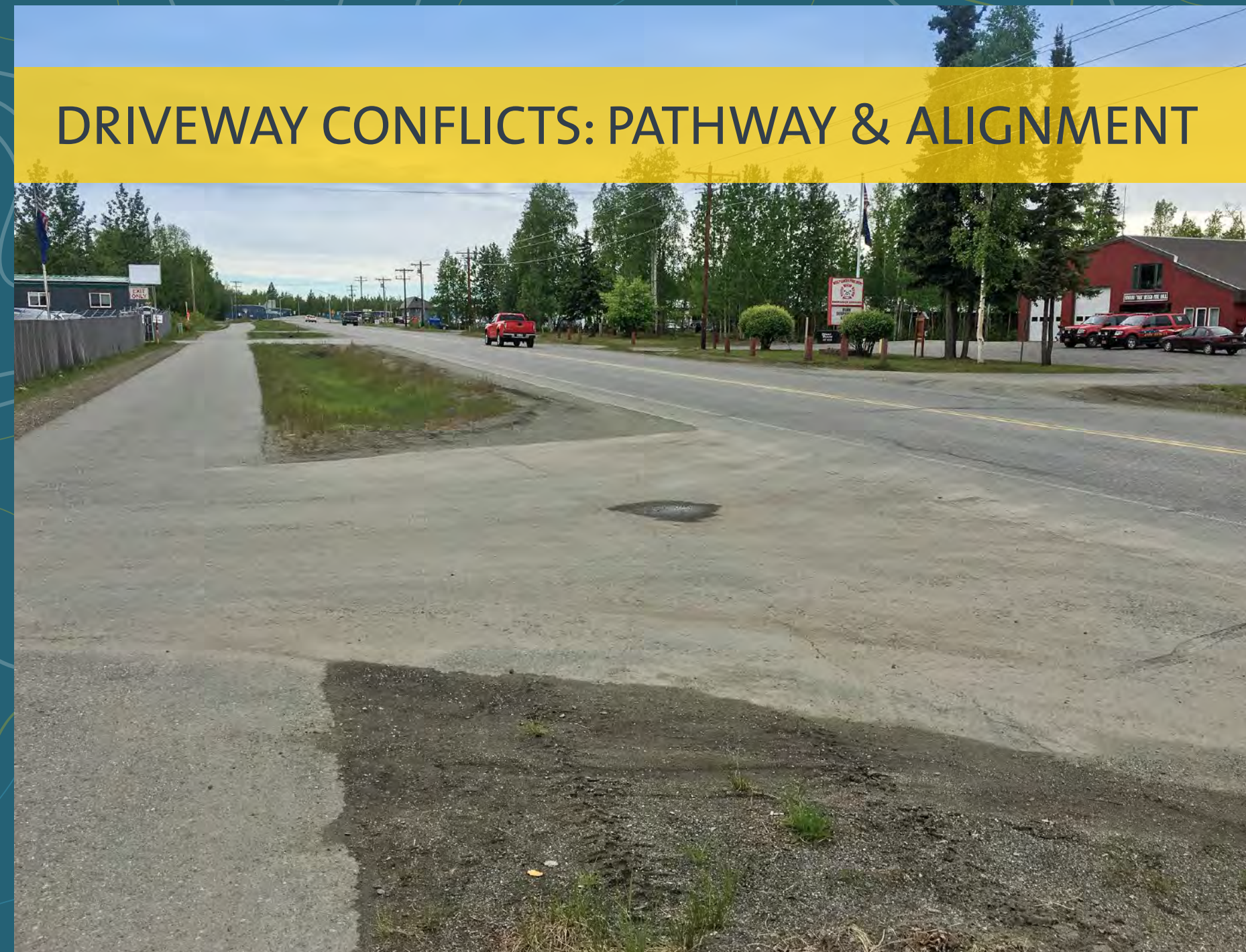
DRIVEWAY CONFLICTS: PATHWAY & ALIGNMENT